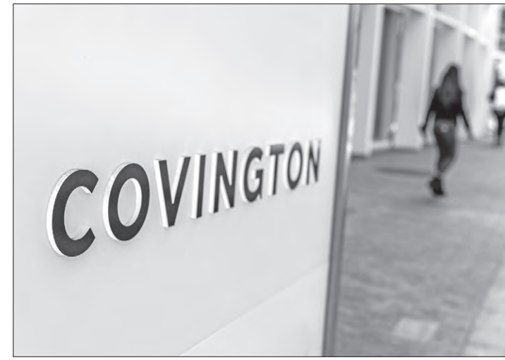
The largest firms were assessed on their total pro bono hours, average hours per lawyer, and overall participation rates. Covington & Burling climbed to the top this year with 100% lawyer participation and over 100 hours per fee earner.