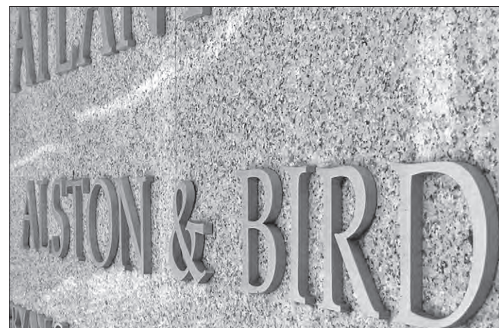
Alston & Bird is one of the firms interested in potentially merging with Cadwalader, Wickersham & Taft, sources say.

According to Am Law 100 data, Cadwalader and Alston have similar revenue per lawyer and profits per equity partner—a positive sign for combination symmetry. Alston brought in $1.331 billion in revenue in 2024, slightly more than double Cadwalader's $638.2 million. In RPL, Alston generated $1.424 million while Cadwalader earned $1.495 million, a difference of only $70,000. Meanwhile, Alston's average PEP was $4.086 million last year, while