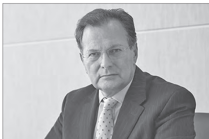
The former Attorney General Lord Peter Goldsmith KC, who was co-head of London at Debevoise, joins his old chambers, Fountain Court which he first joined in 1972.

Goldsmith rose to fame for his advice to the government over the invasion of Iraq in 2003 when he said that the use of force in Iraq was lawful. His resignation from that role took effect on the same day as Tony Blair resigned as Prime