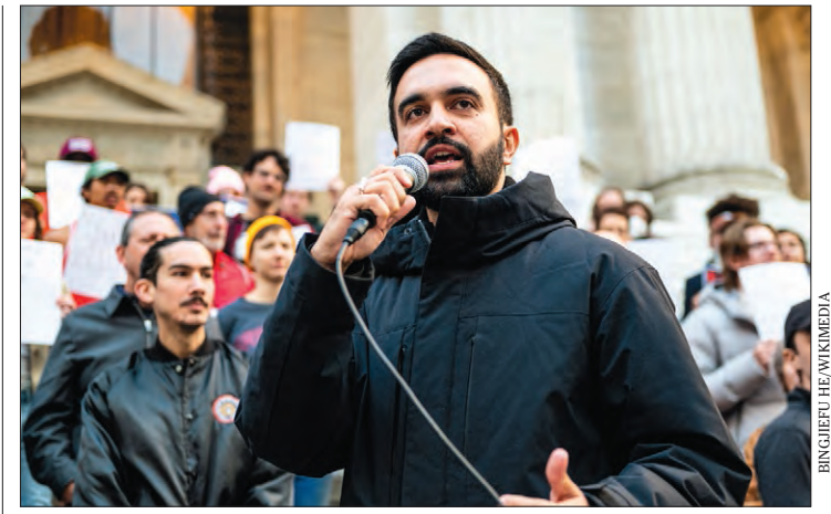
Zohran Mamdani at the Resist Fascism Rally in Bryant Park on Oct. 27.