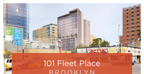
101 Fleet Place BROOKLYN

Representing Property Markets Group regarding New York City's rezoning study for the Gowanus Canal area.