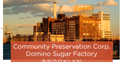
Community Preservation Corp. Domino Sugar Factory BROOKLYN

Represented an affiliate of the Community Preservation Corporation in the development of the 11.5-acre waterfront complex in Williamsburg, that was formerly home to Domino Sugar. We advised on the site's rezoning, which resulted in one of the largest residential redevelopment projects in the city.