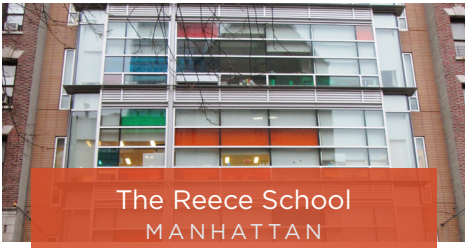
The Reece School MANHATTAN

Represented The Reece School, one of the oldest not-for-profit special needs educational facilities in New York City, in obtaining a variance with the New York City Board of Standards and Appeals for the expansion and modernization of the School's Upper East Side location.