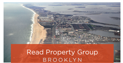
Read Property Group BROOKLYN

Obtained New York City Council approval for BFC Partners to redevelop the Bedford Union Armory in Crown Heights, Brooklyn, into a 500,000-square-foot, mixed-use property with a recreational facility, community venue and office and commercial space.