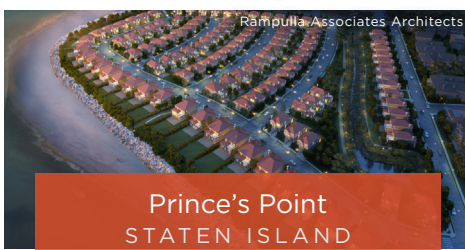
Prince's Point STATEN ISLAND

Represented Madison International Realty in obtaining a certification from the Chair of the City Planning Commission for their property at 2505 Richmond Avenue in Staten Island. The certification will allow MIR to provide a connection between their shopping center and the adjacent Staten Island Mall.