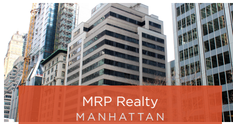
MRP Realty MANHATTAN

Represented Lightstone on the approval of a redevelopment project for a 600-unit rental building to be built in East Harlem; the project features a 80/20 affordable housing arrangement.