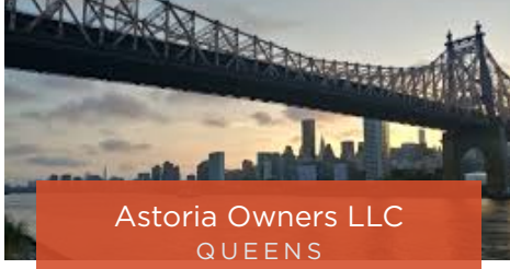
Astoria Owners LLC QUEENS

Representing Montefiore Hospital on expanding into residential areas that adjoin the hospital. We are assisting Montefiore with zoning studies for sites near the primary campus to determine compliance with various requirements for medical use.