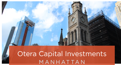
Otera Capital Investments MANHATTAN

Represented RAL Development Services on the redevelopment of 124 East 14th Street into a 21-story, 240,000-square-foot tech-focused office space. The building, which Mayor de Blasio called "the front door for tech in New York City," is a joint venture between the city's Economic Development Corp. and our client RAL. Located on city-owned land, the $250 million project will offer affordable technology training for New Yorkers seeking to join the digital economy.