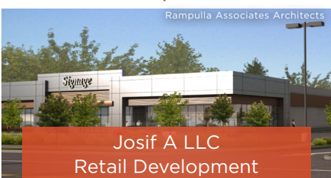
Josif A LLC Retail Development STATEN ISLAND

Represented Fleet Center, Inc. in obtaining approval of a zoning map amendment by New York City Council to modify the decision by the City Planning Commission restoring our client's proposed building to 14-stories with over 200,000 square feet for a planned community facility and office uses.