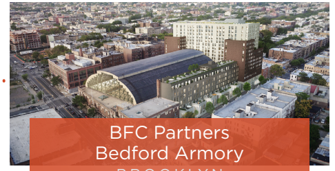
BFC Partners Bedford Armory BROOKLYN

Working to secure a future in Brooklyn for the famous Acme Smoked Fish company by including a new factory as part of a mixed office/retail development adjacent to its current plant at 18 Wythe Avenue.