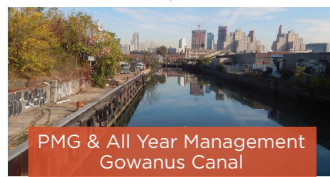
PMG & All Year Management Gowanus Canal BROOKLYN

Successfully secured NYC Council approval for Josif A LLC's 226,000-square-foot retail development in the Mariner's Harbor section of Staten Island. We navigated a multi-year public and environmental review process which culminated in the City Council's approval of the project's Uniform Land Use Review Procedure (ULURP) application.