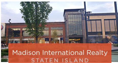
Madison International Realty STATEN ISLAND

Special counsel to Otera Capital Investments IX Inc. in zoning and title matters related to $147.7 million in loans to HFZ Capital Group for an assemblage of several parcels in the NoMad neighborhood of Manhattan where HFZ is planning a 60-story office tower.