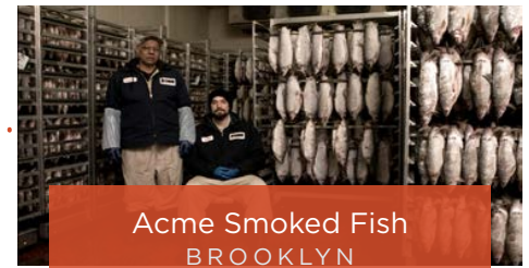
Acme Smoked Fish BROOKLYN

Represented an affiliate of the Community Preservation Corporation in the development of the 11.5-acre waterfront complex in Williamsburg, that was formerly home to Domino Sugar. We advised on the site's rezoning, which resulted in one of the largest residential redevelopment projects in the city.