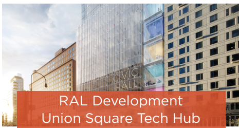
RAL Development Union Square Tech Hub MANHATTAN

Represent Astoria Owners LLC in a rezoning and large scale development of a three-tower, 1400-unit multi-family project on the waterfront in Astoria, Queens.