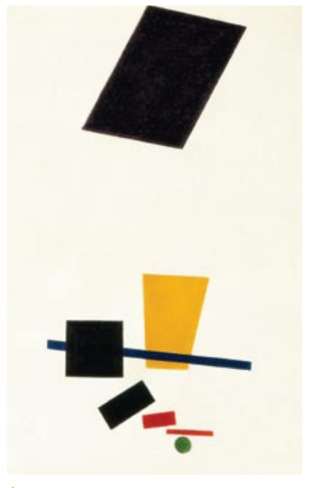
(Painterly Realism of a Football Player (1915), one of the works recovered by the Heirs }

Last, as to the claim that the exhibition loan was not a "commercial activity," the court based its analysis on the "rule of thumb" adopted by the courts in the District of Columbia: "If the activity is one in which a private person could engage, it is not entitled to immunity." Consequently, the court concluded that it was "clear that the City of Amsterdam engaged in 'commercial activities' when it loaned the 14 [Malevich] works to museums in the United States" because there is "nothing 'sovereign' about the act of lending art pieces, even though the pieces themselves might belong to a sovereign." The court explained that, even if the loan were made purely for educational and cultural purposes, as the City alleged, it still would be "commercial activity" under the FSIA. The court cited the language of the FSIA itself: "[t]he commercial character of an activity shall be determined by reference to the nature of the course of conduct or particular transaction or act, rather than by reference to its purpose." 28 U.S.C. §1603(d).