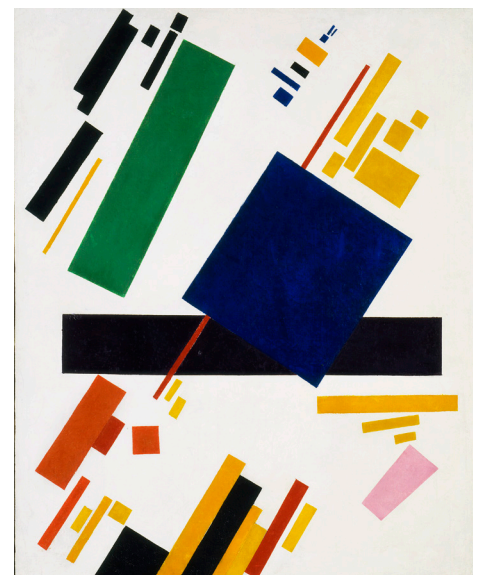
Kazimir Malevich, Suprematist Composition (blue rectangle over purple beam) 1916, Oil on canvas 88 x 70.5 cm., Collection of the Heirs of Kazimir Malevich