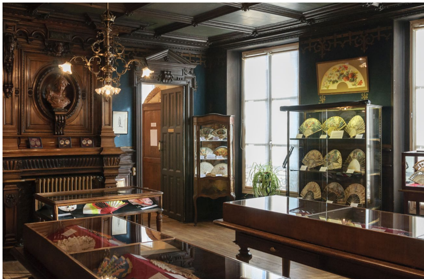
The Musée de l'Éventail, a private museum in Paris.

the general public to visit. This option is likely to appeal only to donors with estates that are large enough to permit a remote portion to be set aside for a museum, at a distance from their personal residence that is sufficient to permit a measure of privacy. This appears to be the price one has to pay to qualify for a charitable tax deduction for art contributed to one's own museum, where the donor can manage the charity and, to a degree, appear to retain the work by keeping it close to home.