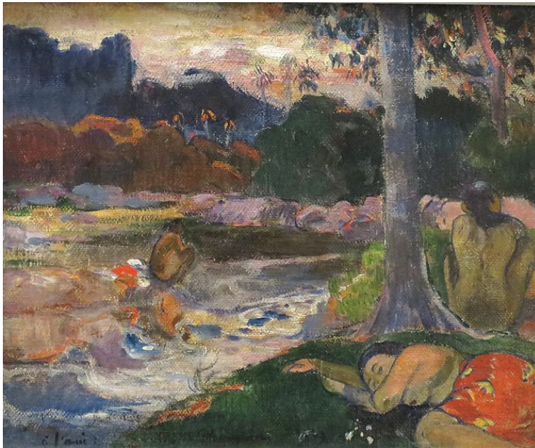
"Tahitians on the Riverbank" by Paul Gauguin is on long-term anonymous loan to the Honolulu Museum of Art.