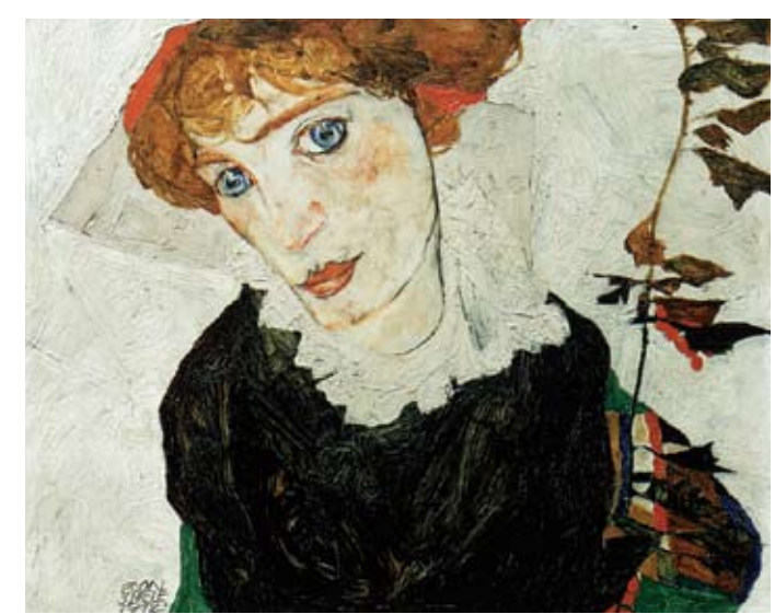
{ Portrait of Wally by Egon Schiele. }

states that pre-war owners and their heirs should be encouraged to come forward to make known their claims to art that was confiscated by the Nazis and not subsequently restituted; another states that once they do so, steps should be taken expeditiously to achieve a just and fair solution. This led several European governments to create restitution commissions to examine or reexamine claims by victims and their families. And museums all