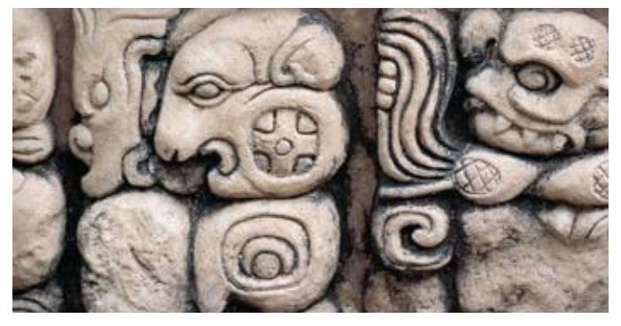
{ Example of a Guatemalan stele }

In addition to requiring that property qualify as "stolen" under the NSPA, the Government must also demonstrate that the defendant knew that he or she was dealing with unlawfully stolen or converted objects. Such knowledge may be imputed based on the facts and circumstances of the case. For example, in Hollinshead, although the defendant claimed he had no knowledge of Guatemalan patrimony laws, he had i) bribed Guatemalan officials to export the artifacts to a fish packing plant in Belize; ii) financed and arranged for the artifacts to be packed in his presence and marked "personal effects"; and iii) shipped the artifacts to his address in California. The Ninth Circuit upheld the defendant's conviction, noting that "[i]t would have been astonishing if the jury had found that [the defendant] did not know that the stele was stolen." Hollinshead, 495 F.2d at 1155; see also United States v. Aleskerova, 300 F.3d 286 (2d Cir. 2002) (upholding the conviction of Natavan Aleskerova for possession and conspiracy to possess and sell stolen art in violation of the NSPA; the defendant's clandestine activities, including covert meetings and conversations, established the requisite knowledge that the artworks were stolen).